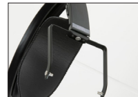
New Case Holder